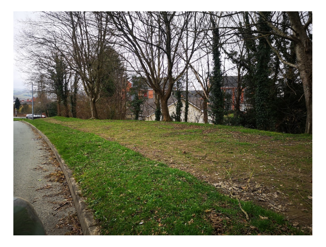
FIGURE 2.2: A VERGE IN NEWTOWN THAT THE CUT & COLLECT MACHINE HAS BEEN USED ON BEFORE SEEDING WITH A WILDFLOWER MIX.