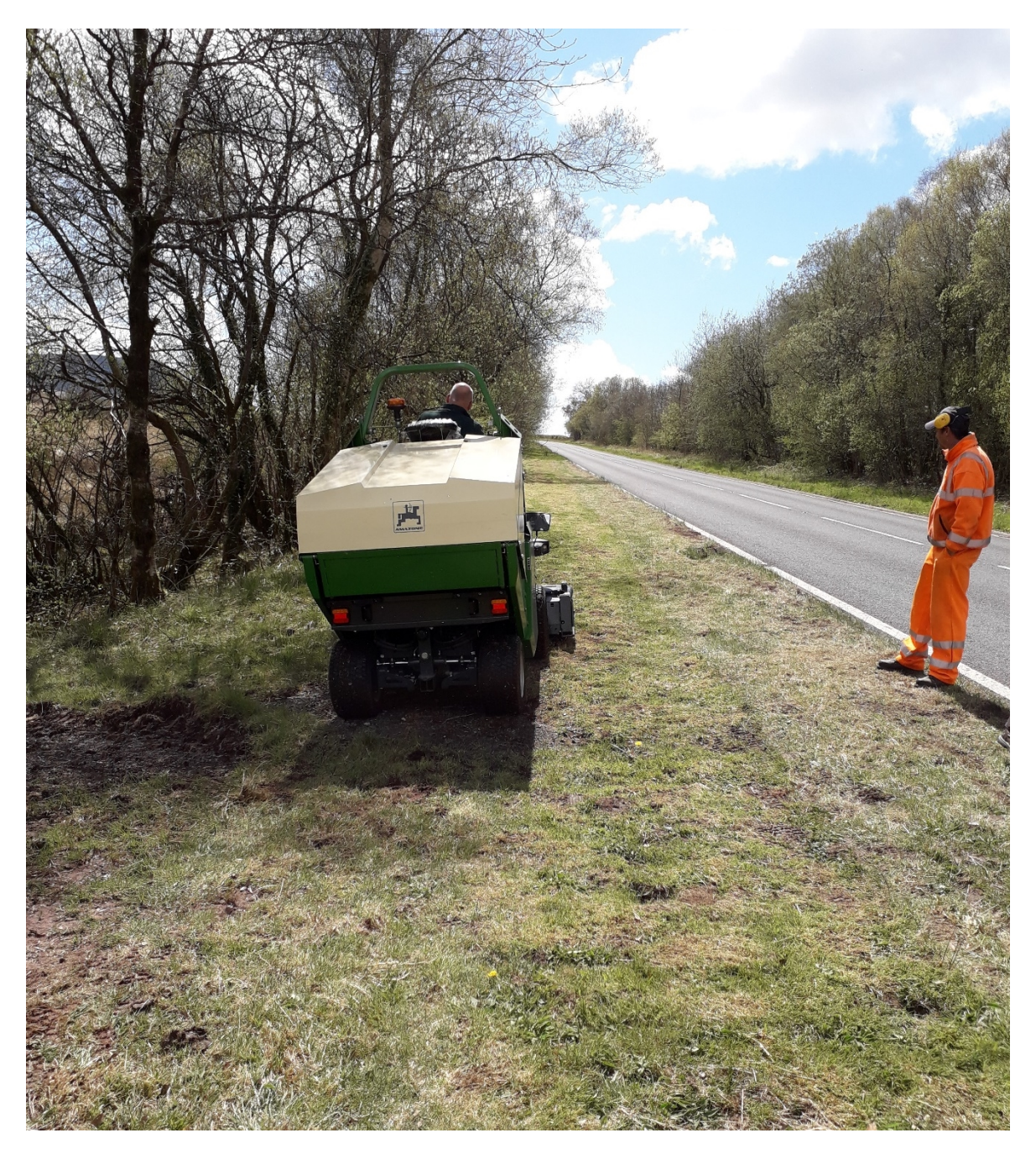
FIGURE 2.1: CUT & COLLECT MACHINE USED BY HIGHWAYS TO MANAGE ROADSIDE VERGE NATURE RESERVES (RVNRs).