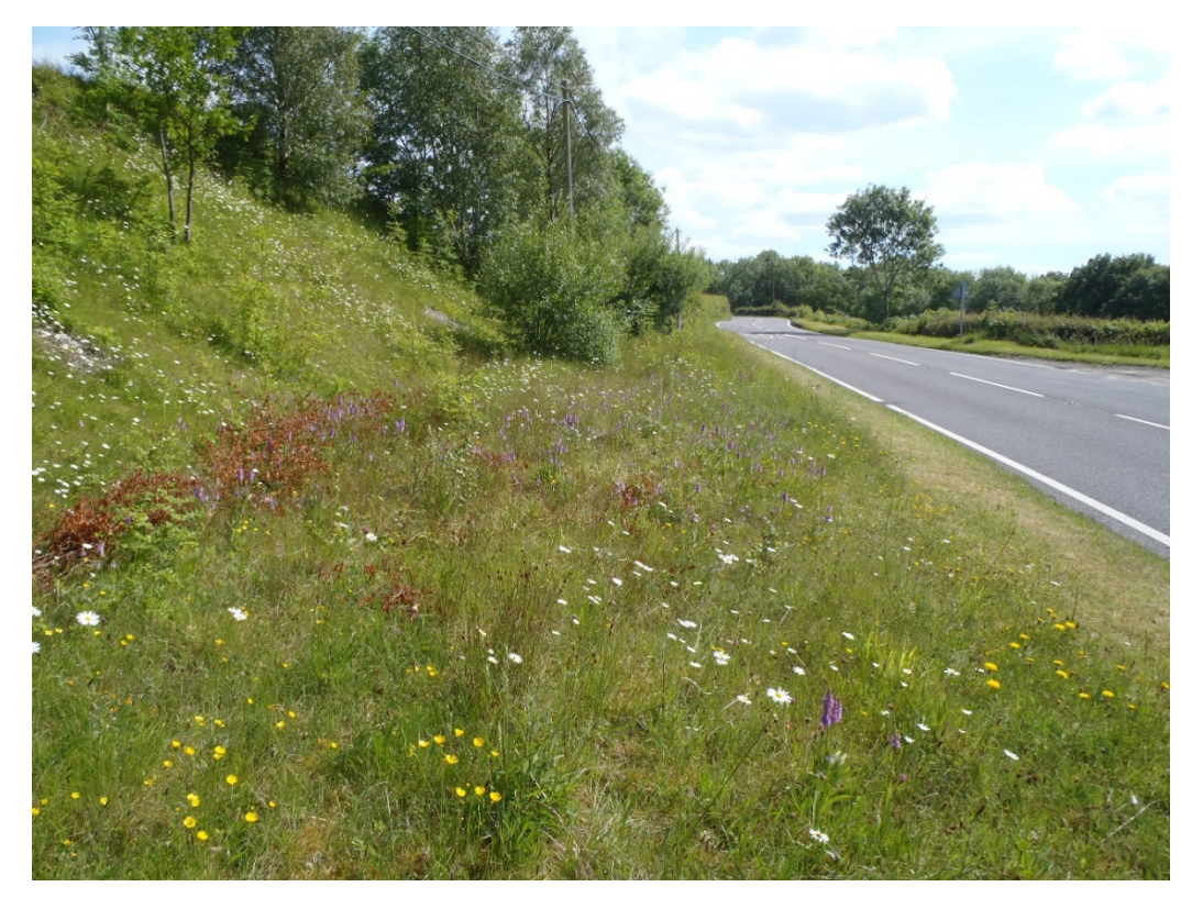
FIGURE 2.3: EXAMPLE OF PLANT DIVERSITY GENERATED BY CUT AND COLLECT MANAGEMENT.