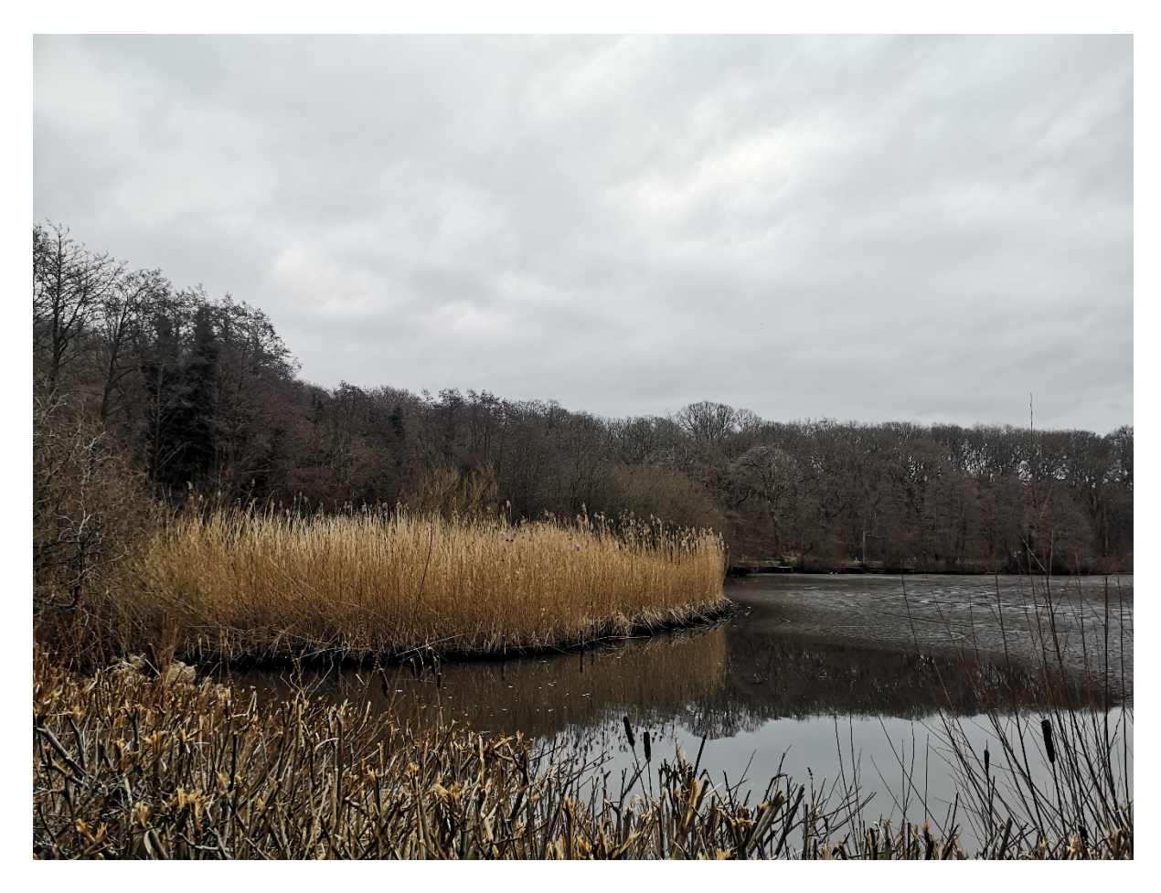
FIGURE 3.1: REED BEDS AT THE LAKE PARK LOCAL NATURE RESERVE.

partitions for territorial reed warblers. Mitigating for bird species benefits people in turn as many visit the LNR to watch and photograph birds. Further structures have been put in place for people to stand over the water and observe wildlife. At the end of 2022, several hundred native trees were sourced from the Woodland Trust for planting next to the SSSI adjacent to the lake to extend the area of woodland.