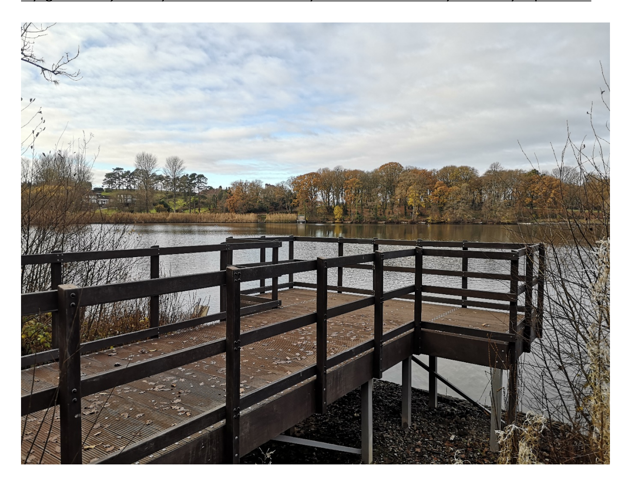
FIGURE 3.2: A PLATFORM FOR PEOPLE TO WATCH WILDLIFE AT THE LAKE PARK LOCAL NATURE RESERVE.