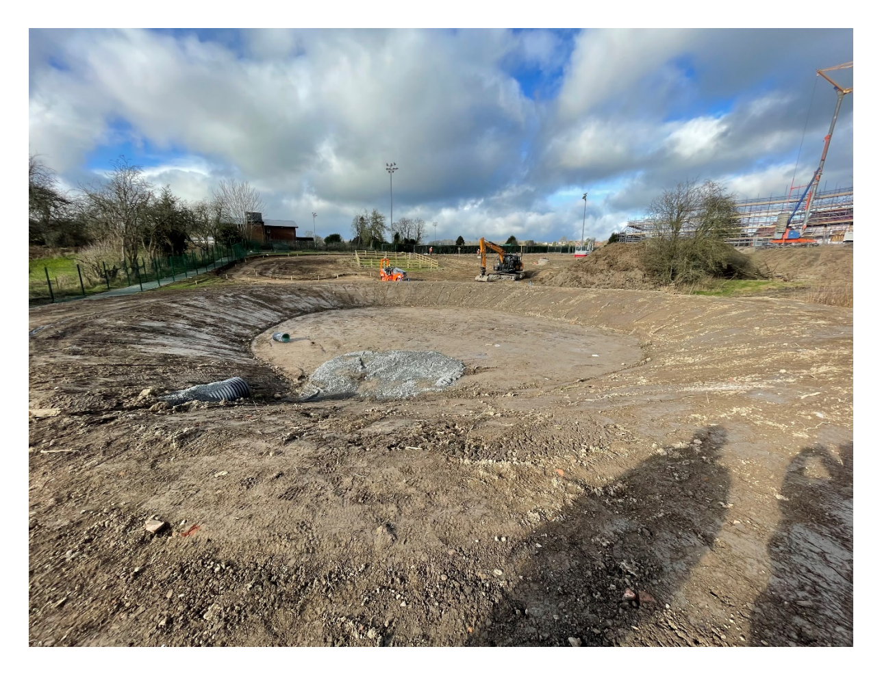
FIGURE 4.1: CONSTRUCTION OF A POND AT YSGOL GYMRAEG Y TRALLWNG IN 2022.

SAB are members of the Severn Partnership working with organisations and landowners to adopt natural flood management in the Upper Teme Catchment. Leaky dams, scrapes, and ponds, slow the flow of water into tributaries whilst providing habitat for species such as waterfowl. SAB have also partnered with RSPB Cymru in North Powys to restore peatlands and bogs around Lake Vrynwy providing wetland habitat and reducing pressure on the drainage systems in the area.