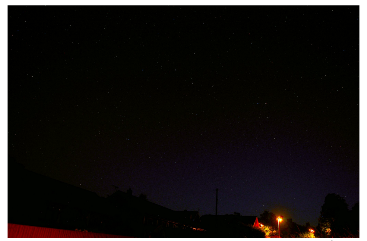
FIGURE 4.3: DARK SKIES LIGHTING IN PRESTEIGNE – TAKEN FROM PRESTEIGNE DARK SKIES GROUP (PRESTEIGNE DARK SKIES | FACEBOOK).