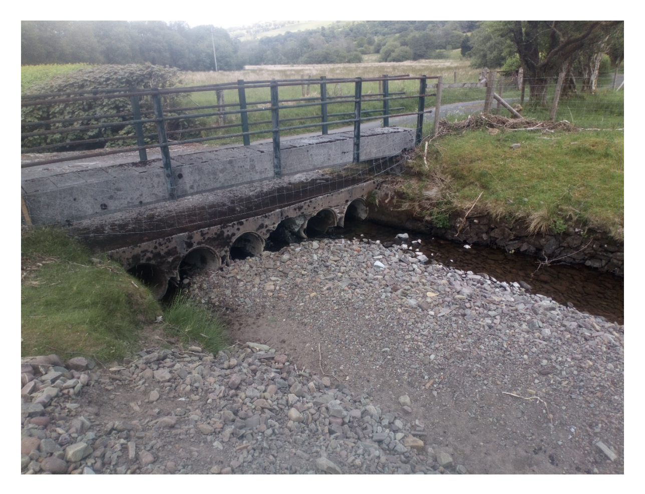
FIGURE 4.2: THE ACCUMULATION OF SEDIMENT UPSTREAM OF THE TYLE-Y-GARW CULVERT, HEOL SENNI.