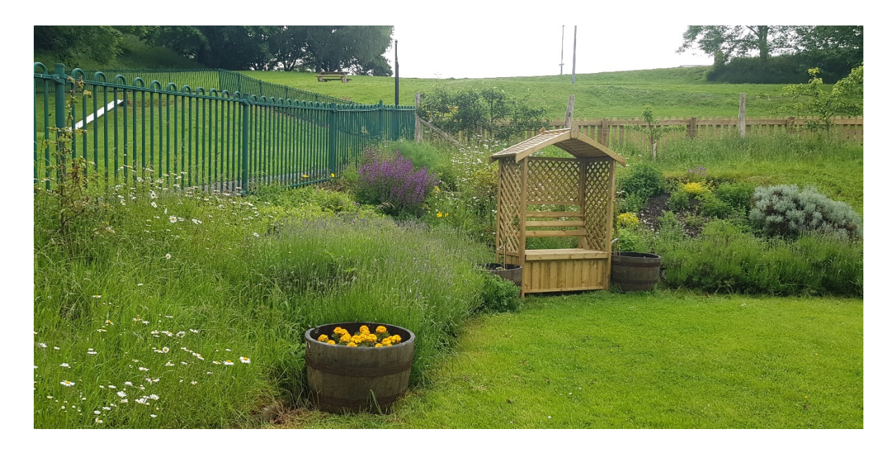
FIGURE 3.3. KNIGHTON COMMUNITY AND WILDLIFE GARDEN – HERB GARDEN AND SEATING AREA