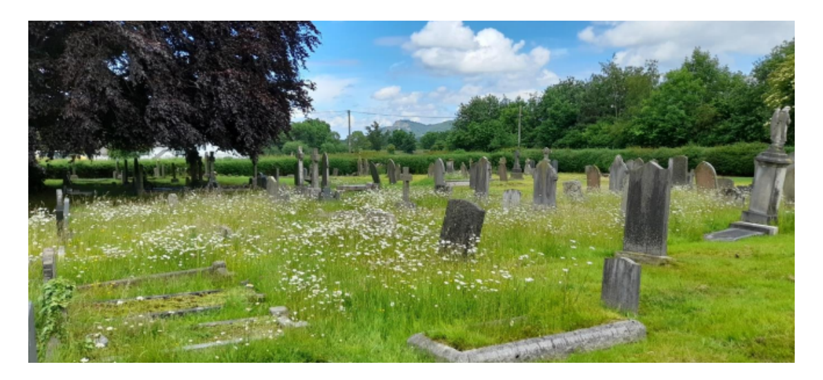
FIGURE 3.2: GRASSLAND MANAGEMENT FOR WILDFLOWERS ON A COUNCIL BURIAL SITE.